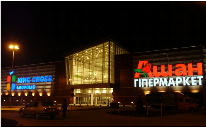
KING CROSS LEOPOLIS is the most recent shopping centre of the group. It was opened in March, 2010.